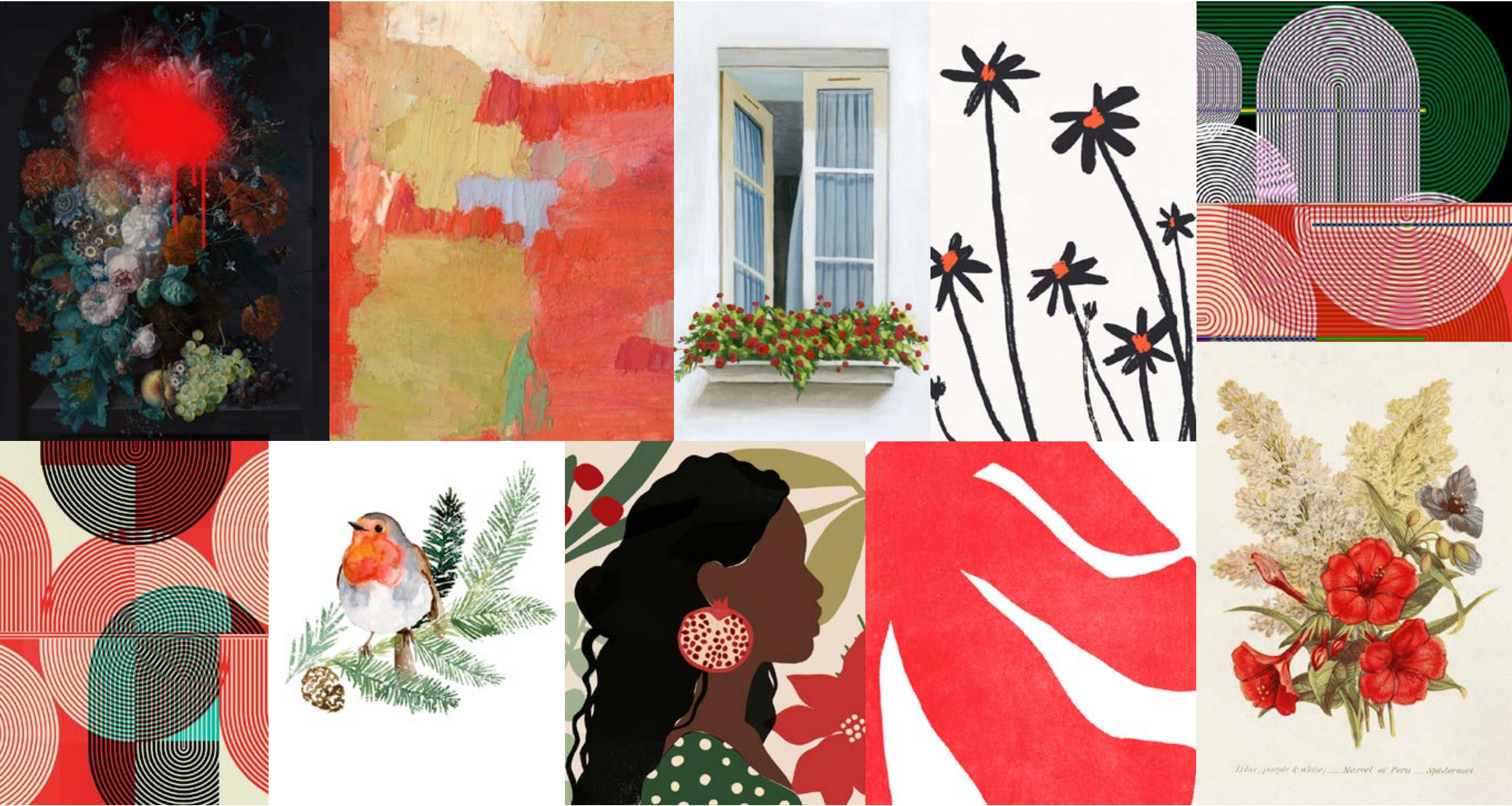
red A strikingly bold hue that is sure to catch the eye. Be daring and add a splash of red for a dramatic appeal.